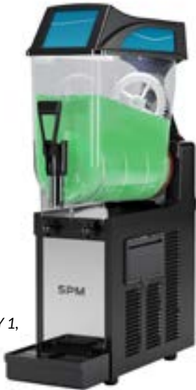
FROSTY 1, black

Customizable parts: Front panel, flavour marker, lid and back of unit