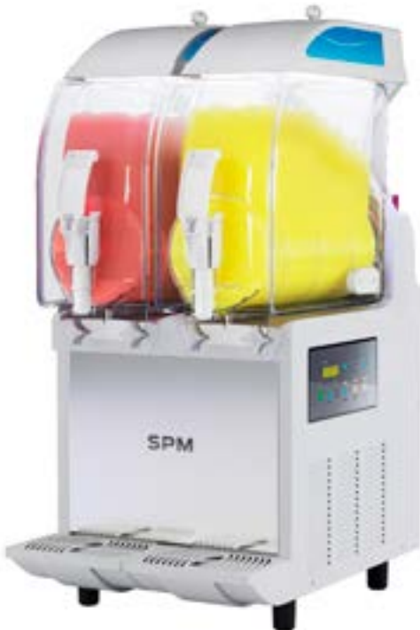
I-PRO 2 Electronic, white