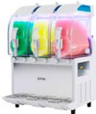
I-PRO 3 UV Electronic, white