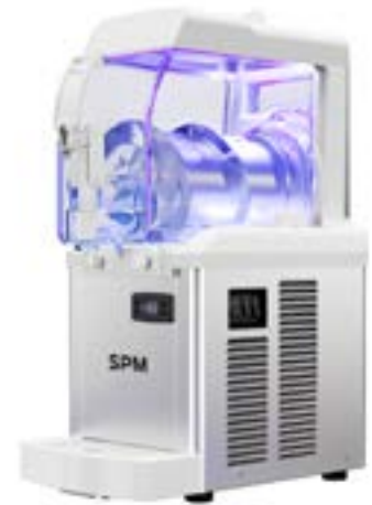
SP1 UV, white

Customizable parts: Front panel, lid, back of unit