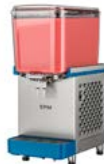
CLASSIC PRO 1x18