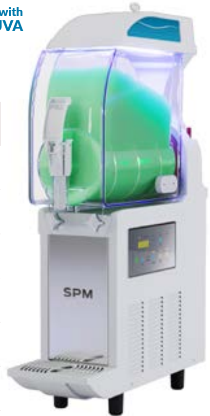
I-PRO 1 UV Electronic, white