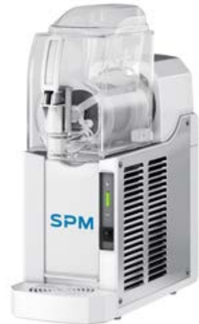
NINA 1 with I-Tank, white

Cold cream and sherbet dispenser, 2 liters tank.