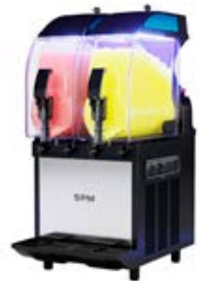
I-PRO 2 UV Mechanical, black