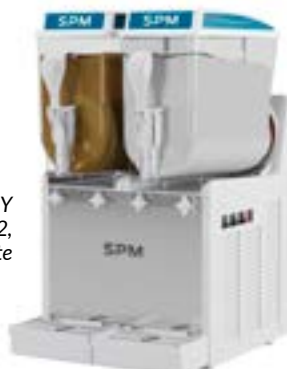
SORBY EVO 2, white