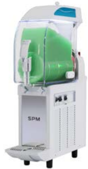
I-PRO 1 Mechanical, white

Customizable parts: Front panel, lid, back of unit