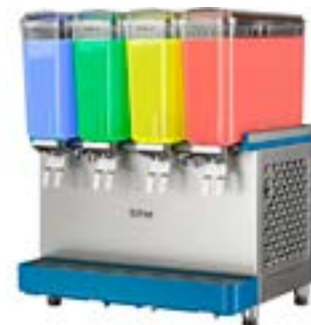
CLASSIC PRO 4x9