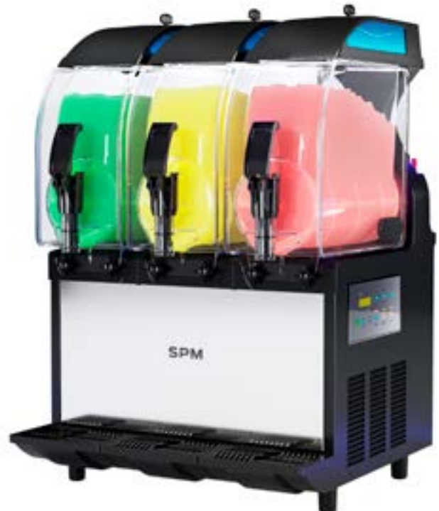
I-PRO 3 Electronic, black