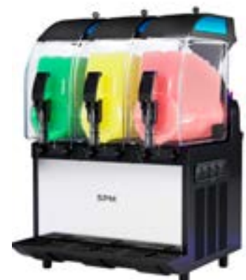
I-PRO 3 Mechanical, black

Customizable parts: Front panel, lid, back of unit