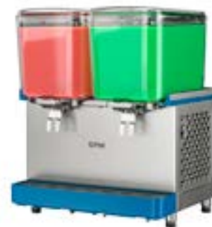
CLASSIC PRO 2x18