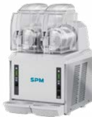
NINA 2 with I-Tank, white