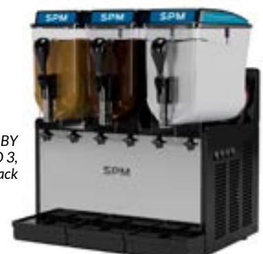
SORBY EVO 3, black