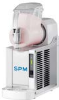
NINA 1, white

Available Colors: Customizable parts: Front and back of unit