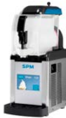
GT TOUCH 1, black

Customizable parts: Front panel, lid, back of unit