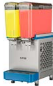
CLASSIC PRO 2x9