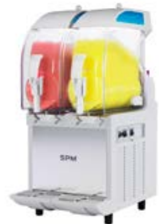
I-PRO 2 Mechanical, white

Customizable parts: Front panel, lid, back of unit