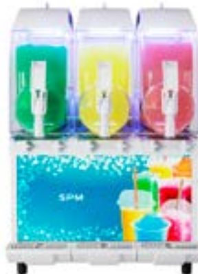
I-PRO 2 UV with LED frontal panel, white