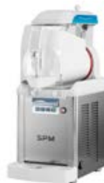
GT PUSH 1, white

Customizable parts: Front panel, lid, back of unit