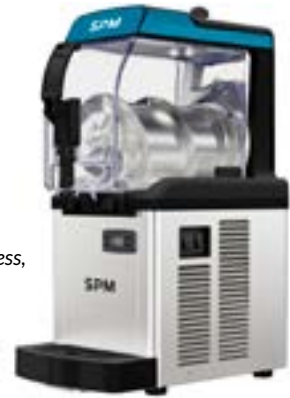
SP1 brushless, black