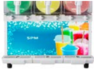
I-PRO 3 Light Kit