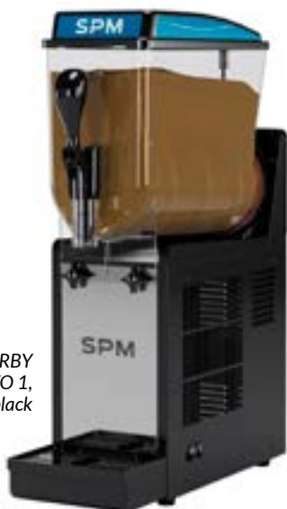
SORBY EVO 1, black

Customizable parts: Front panel, lid and back of unit