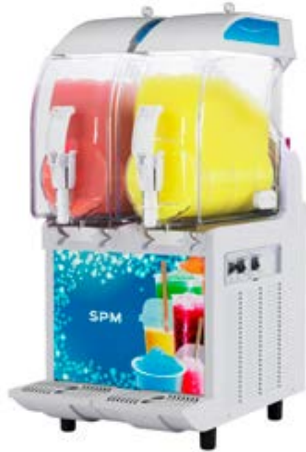
I-PRO 2 Light Kit

Available as a factory-installed option or as a retrofit solution.