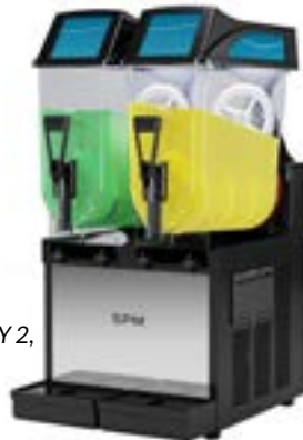
FROSTY 2, black