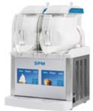
GT TOUCH 2, white