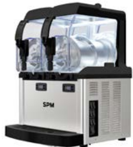
SP2 Luce, black

Customizable parts: Front panel, lid, back of unit