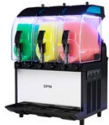
I-PRO 3 UV Mechanical, black