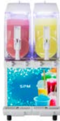
I-PRO 2 UV with LED frontal panel, white