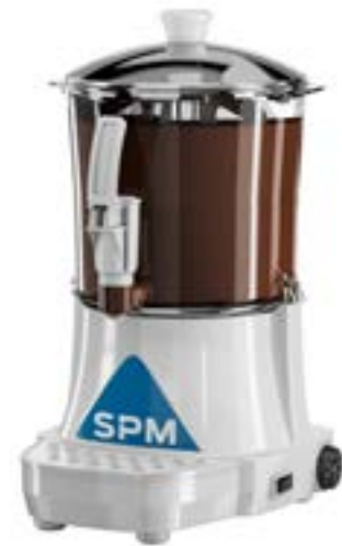
LOLA 6, white

Customizable parts: Front, back and flavour marker