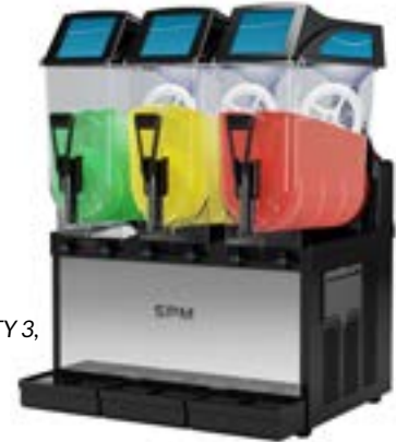
FROSTY 3, black