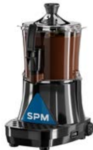
LOLA 3, black

Customizable parts: Front, back and flavour marker