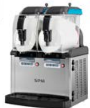
GT PUSH 2, black