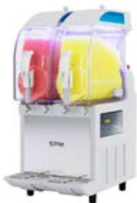
I-PRO 2 UV Electronic, white

Customizable parts: Front panel, lid, back of unit